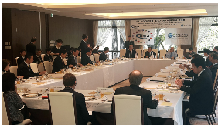
ERIA and the Organisation for Economic Co-operation and Development (OECD) hosted a meeting between the heads and the Parliamentary Leagues for both organisations on 16 April 2019 in Tokyo, Japan.