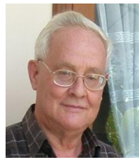
Benedict Anderson (1936-2015)

Professor Emeritus at Cornell University