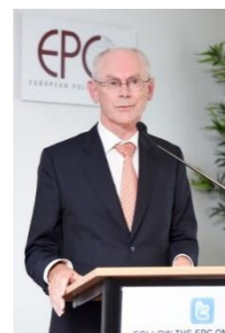
Herman Van Rompuy

Haiku Ambassador for Japan-EU Friendship and President Emeritus of the European Council