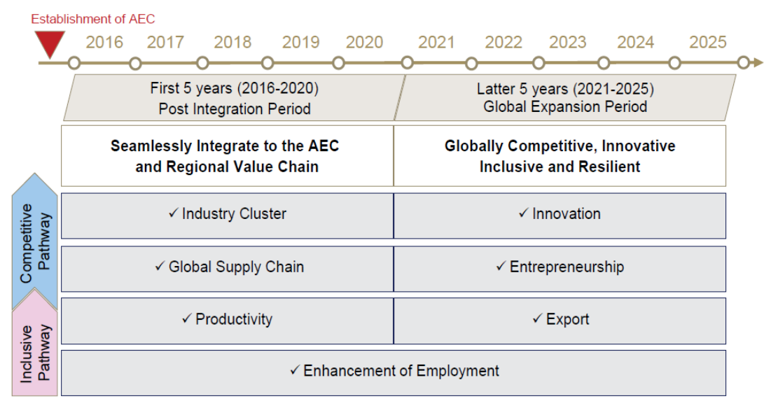
Figure 3: Actions and Pathways in ASEAN Strategic Action Plan for SME Development 2016–2025

AEC = ASEAN Economic Community, ASEAN = Association of Southeast Asian Nations, SME = small and medium-sized enterprise.