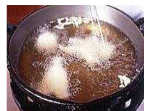
Waste cooking oil