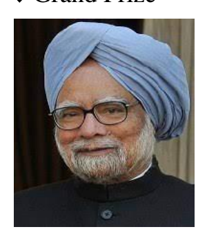
Manmohan Singh Former Prime Minister, Republic of India