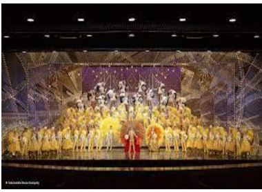
Takarazuka Revue Japanese Theatrical Company