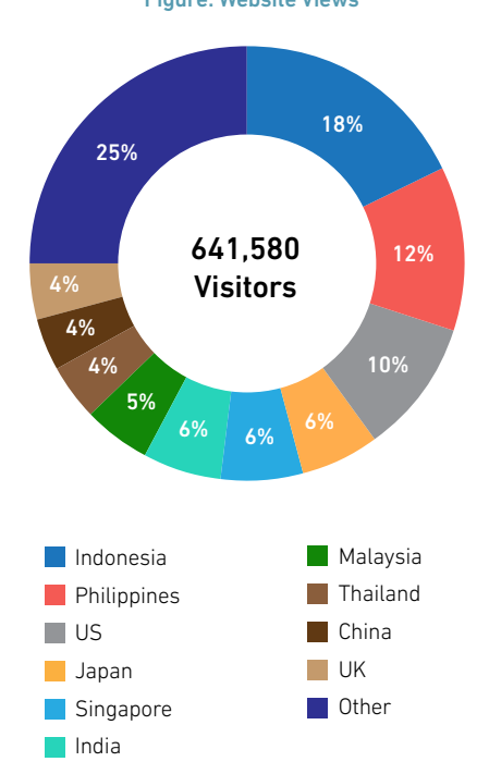
Figure: Website Views

publications for free through Google Scholar and directly from its website. The website was visited almost 650,000 times. Some of its publications are featured on the Asia Development Bank Institute's website Think Asia, ADB SEADS's website, UNCTAD E-trade for All, and the World Economic Forum's Strategic Intelligence platform.