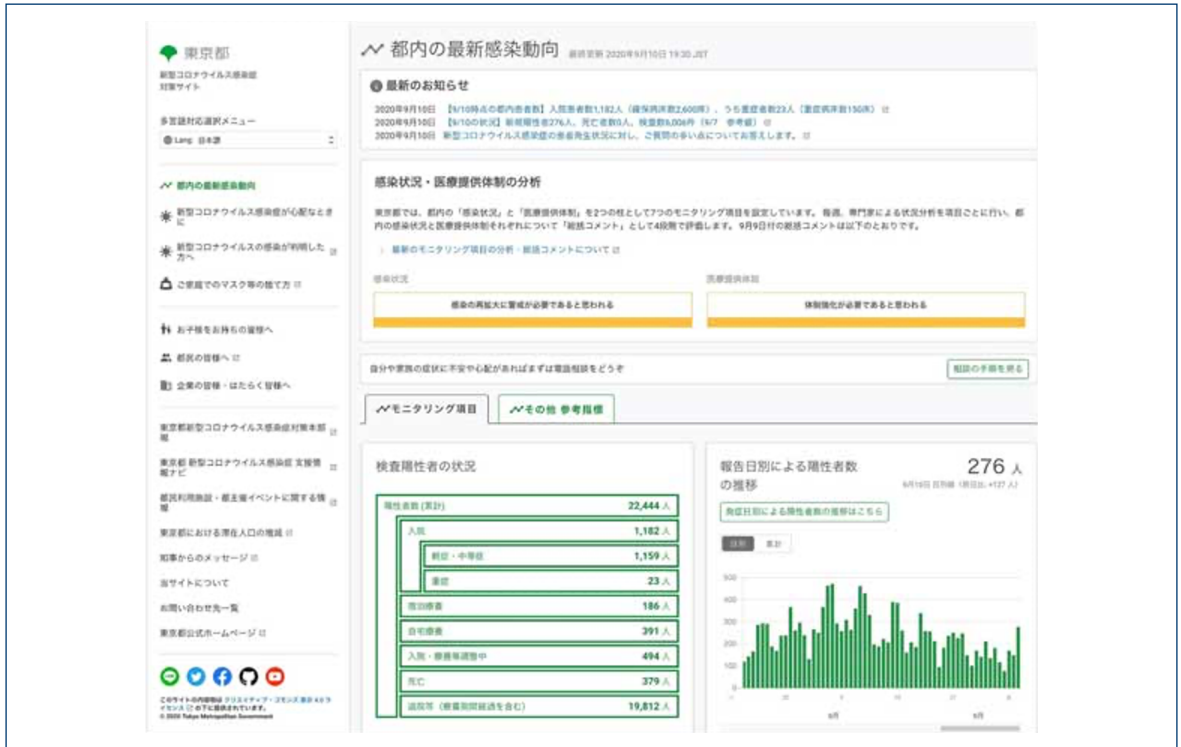
Figure 2.4. Tokyo Metropolitan Government COVID-19 Dashboard