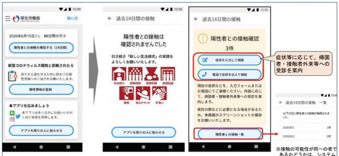
Figure 2.8. Images of COCOA

The Japanese Contact-Confirming Application (COCOA) was developed based on the API provided by Google and Apple, so that contact confirmation could work between Android smartphones and iPhones (Figure 2.8). However, the MHLW did not initially have enough administrative staff familiar with the app's development and relied on contracted vendors for its development and operation. As a result, APIs were not updated – causing problems such as contacts not being recorded due to app errors, which led to distrust amongst citizens.