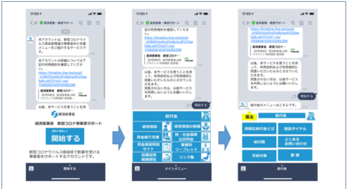
Figure 2.1. Schematic Diagramme of Oil Refinery Process

SMEs = small and medium-sized enterprises.