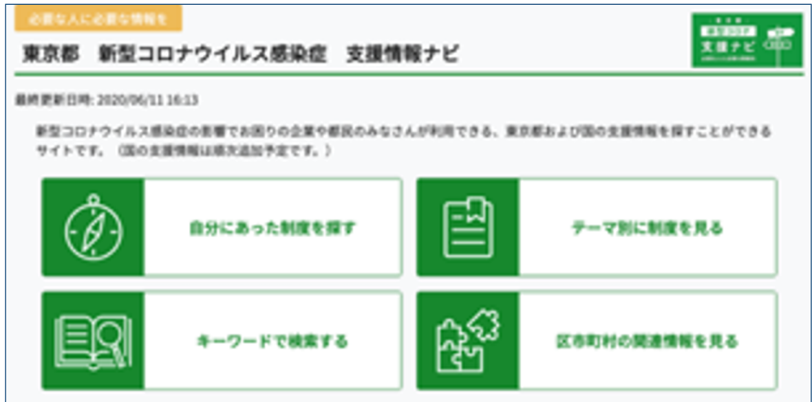
Figure 2.3. Support Search Site on Tokyo Metropolitan Government Website