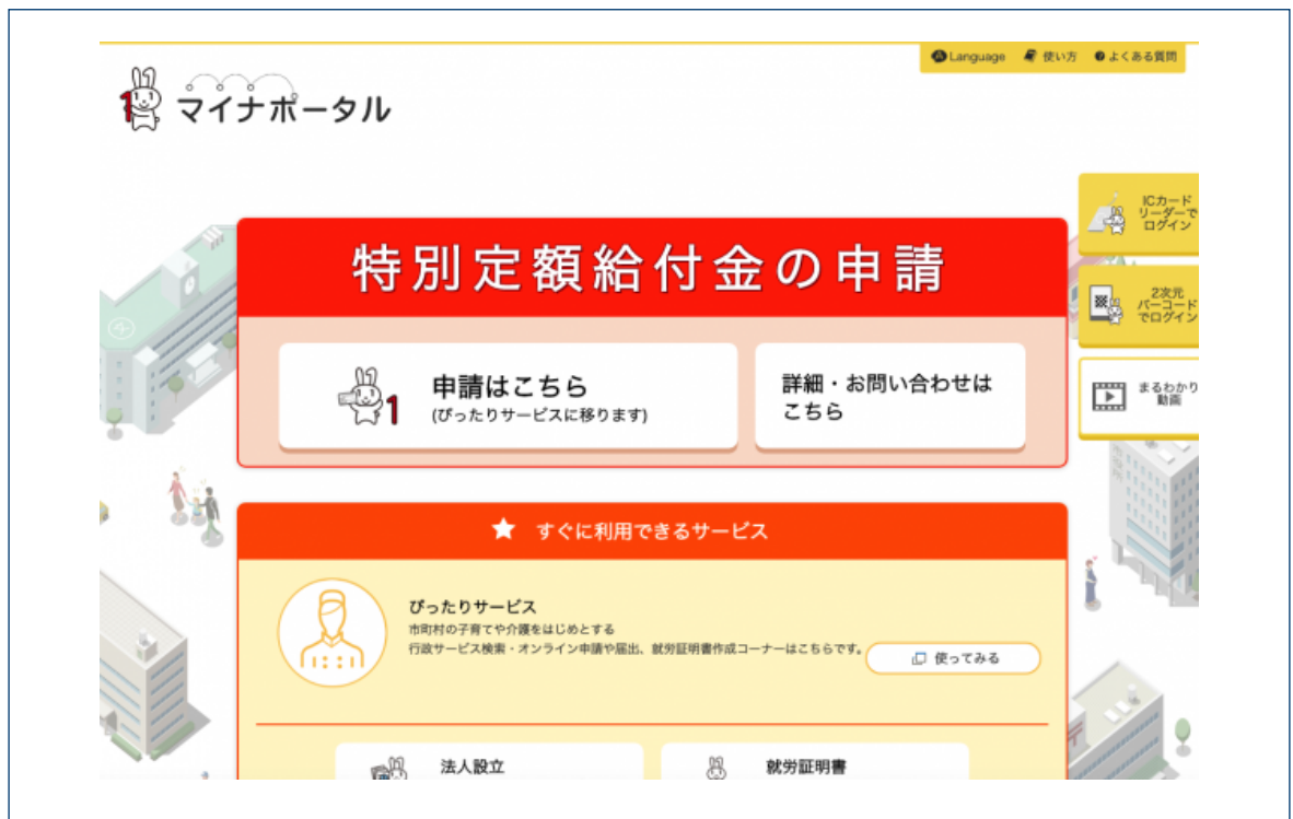
Figure 2.7. Applications for Cash Support to Citizens Website