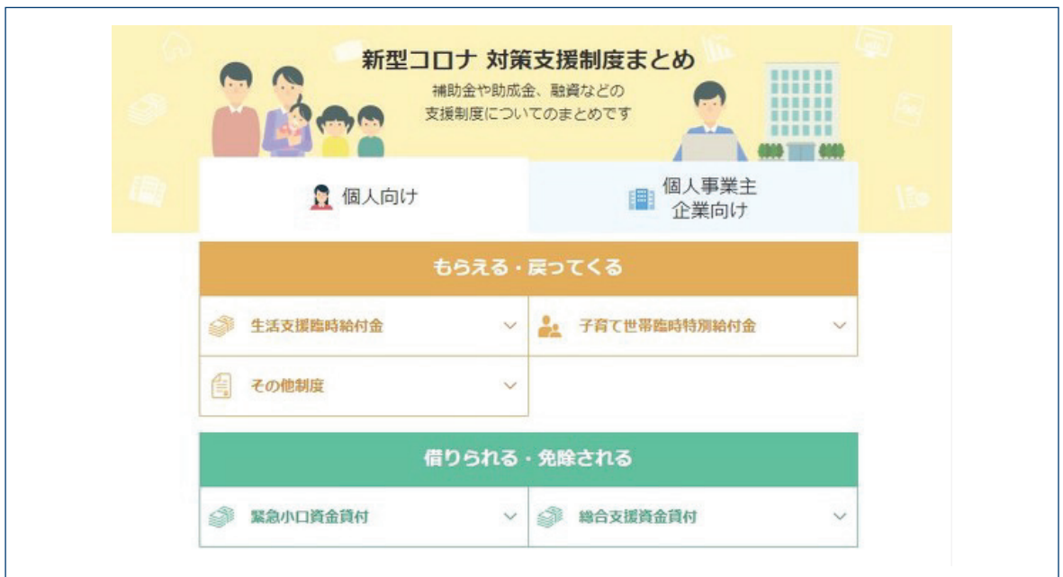
Figure 2.2. Support Search Site on Yahoo! Japan