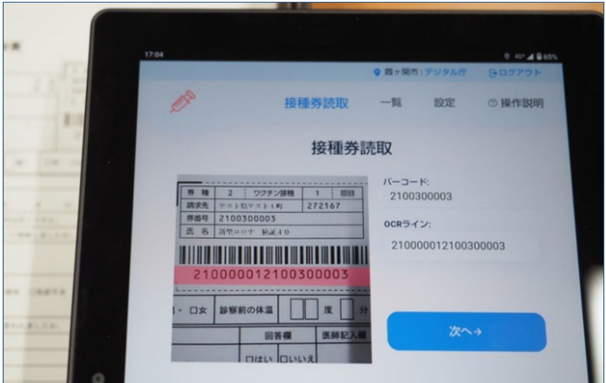
Figure 2.5. Coupon Number Reader for VRS