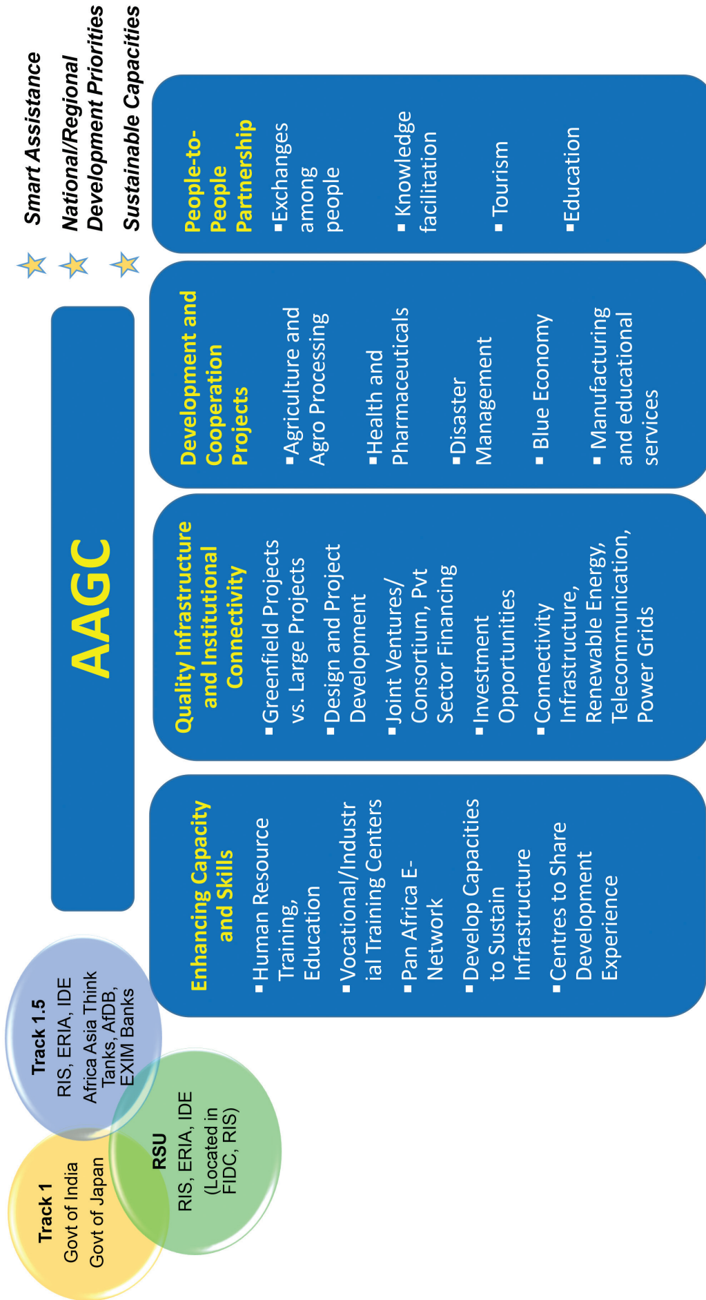
Figure 1: Elements of Asia Africa Growth Corridor