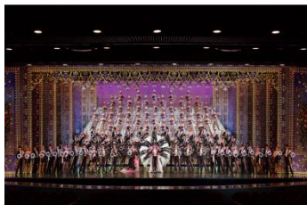
The Takarazuka Revue Company