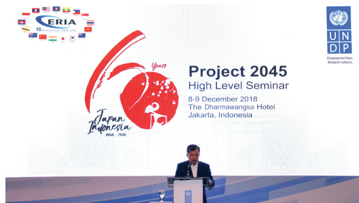
Vice President H.E. Drs. H.M. Muhammad Jusuf delivered an opening remark during the reception of High Level Seminar on Project 2045: 'The Path to Peaceful and Prosperous Indonesia 2045', in Jakarta, Indonesia.

The High Level Seminar Project 2045 reflects how after six decades of strong, cooperative bilateral relations, Indonesia and Japan remain dedicated in further deepening ties for the realisation of an equitable society. ■