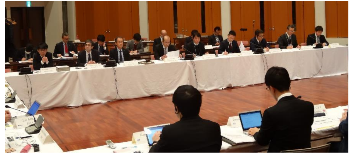
Figure 2. Maizuru Workshop (representatives from local governments)