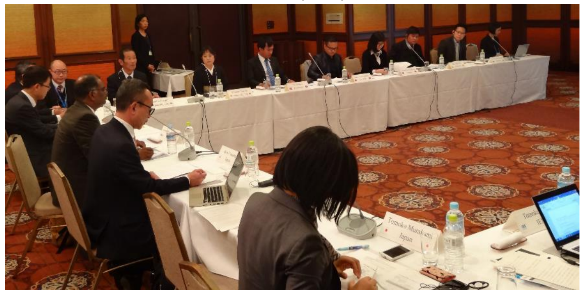
Figure 4. Omaezaki Workshop (opinion leaders from Omaezaki and ERIN member participants)