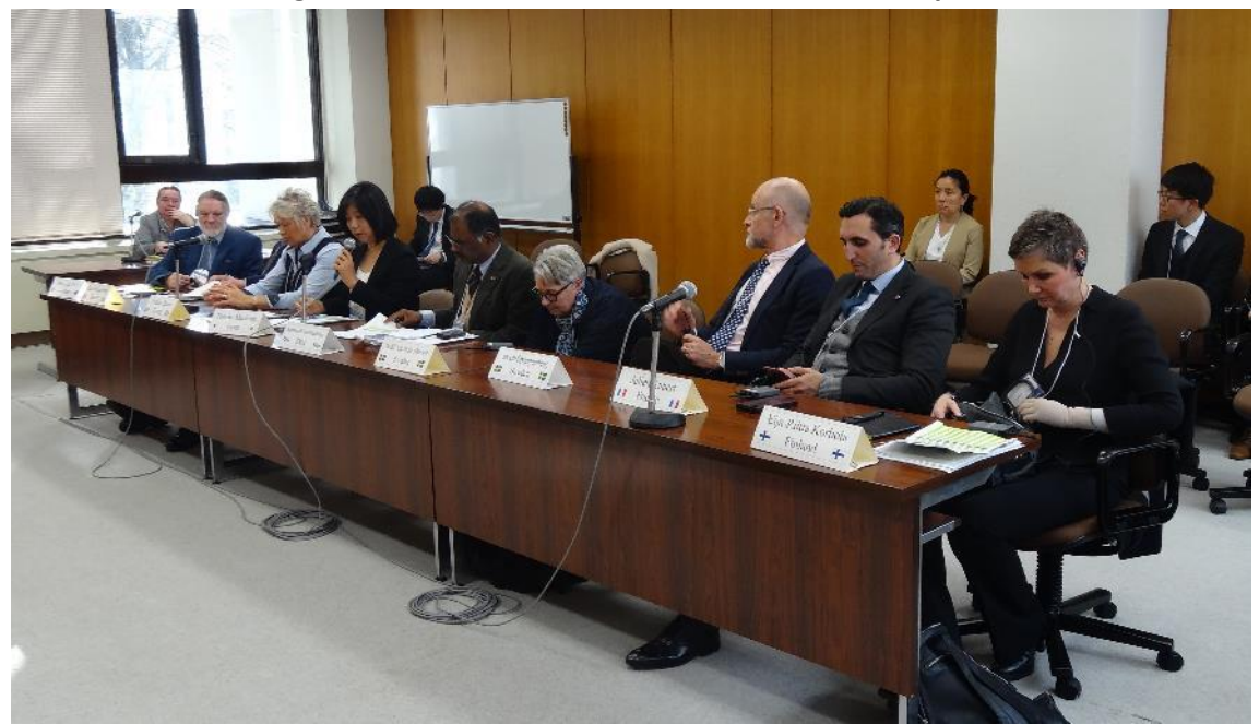
Figure 6. Press Conference after Maizuru Workshop

Press conferences were held after each workshop (Figure 6). The press asked questions on the public stance on nuclear use in each country, strategies to improve public acceptance of nuclear power in each country, plans to introduce nuclear power in Asian countries, the purpose of this public acceptance improvement project, amongst others. NHK (Japan Broadcasting Corporation) broadcast the Maizuru workshop held in the neighbouring municipality in the Kyoto local news.