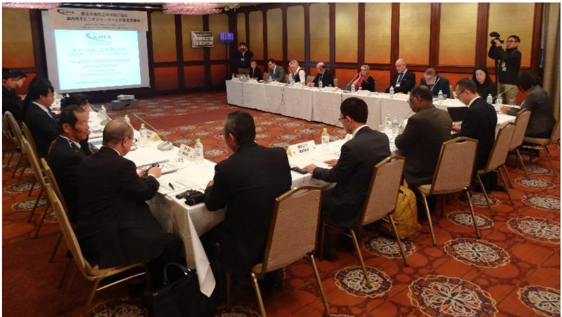
NPP = nuclear power plant.