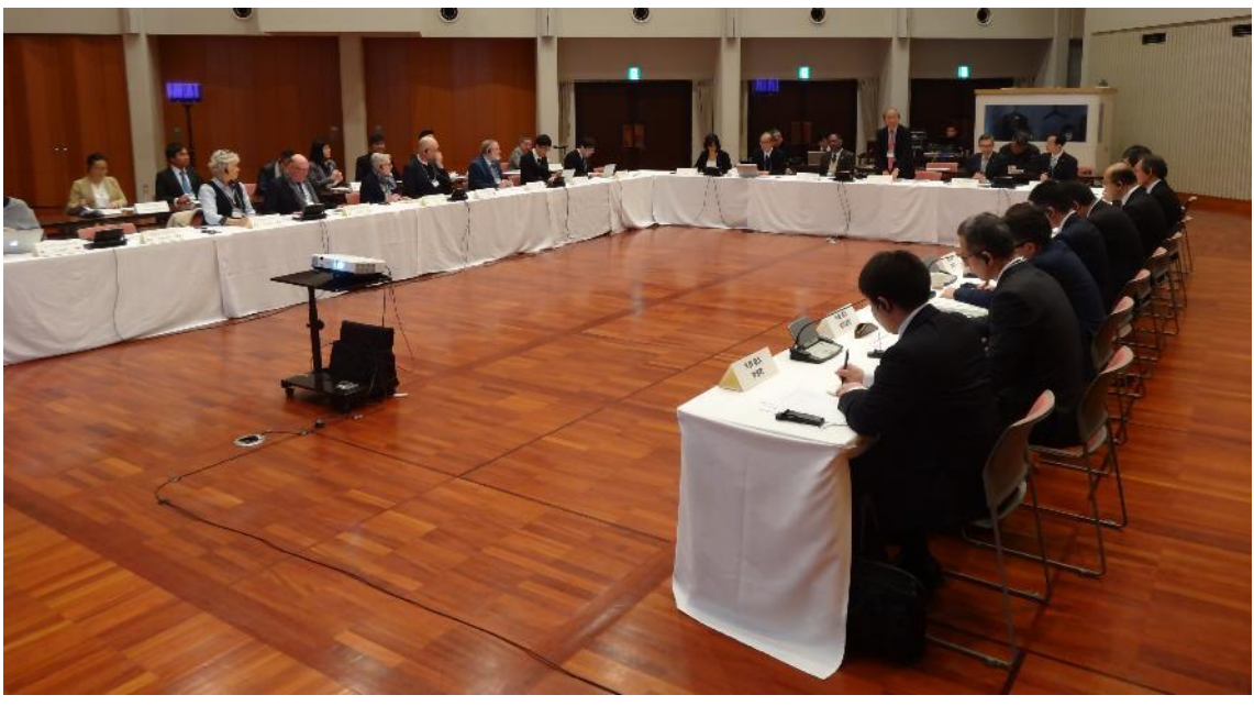
Figure 1. Maizuru Workshop (the neighbouring municipality)