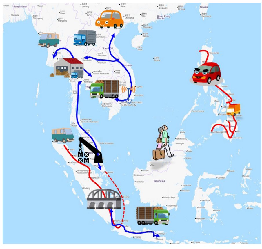
Figure 22: Improved Land Connectivity with SGT

ASEAN = Association of Southeast Asian Nations, GNSS = global navigation satellite systems \\ SGT = space and geospatial technology.