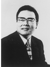
H.E. Dr. Lee O Young, First Minister of Culture of South Korea