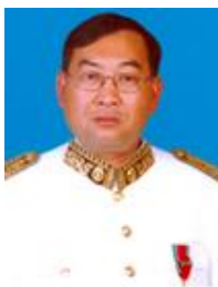
H.R.H. Samdech Norodom Sirivudh, Founder and Chairman of the Board of Directors Cambodian Institute for Cooperation and Peace (CICP)