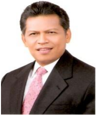
H.E. Dr. Surin Pitsuwan, Former Secretary-General of ASEAN