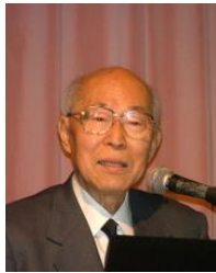
H.E. Dr. Akito Arima, Former Minister of Education of Japan Former President of the University of Tokyo Chancellor of Musashi Academy of the Nezu Foundation Japan